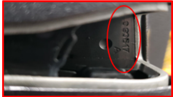
Above: Driver side door is pictured; passenger side door is similar