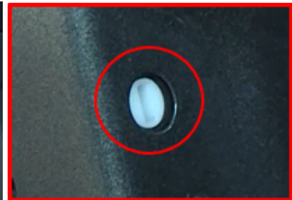
Above: Driver side door is pictured; passenger side door is similar