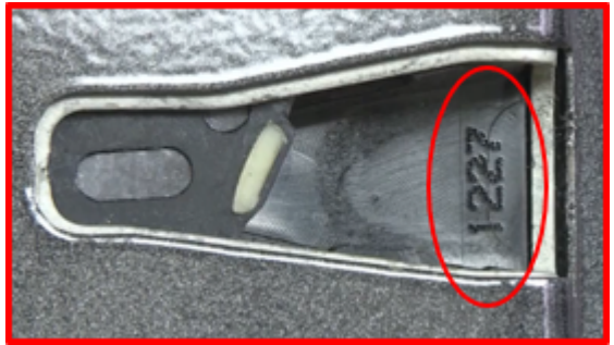
Above: Driver side door is pictured; passenger side door is similar